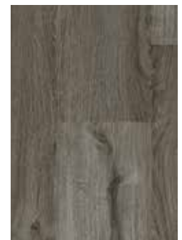
730 Pepper Oak