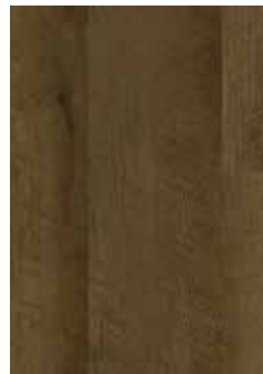
360 Auburn Oak