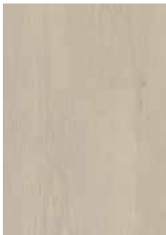
110 Antique Oak

Wood Effects Plus is an extremely hard wearing, stable and waterproof ^ hybrid floor, making it ideal for all areas of your home. With an embossed matte finish, micro bevel edges and realistic tonal variations, Wood Effects Plus features a stunning natural timber wood grain look. A scratch and stain resistance surface coating means Wood Effects Plus can easily withstand the everyday wear and tear of busy family homes.