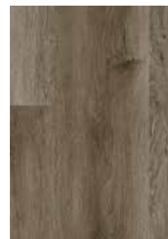
560 Lodge Oak