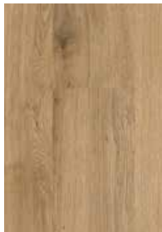
300 Natural Oak