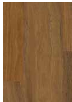
555 Spotted Gum