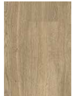
515 Ancient Oak