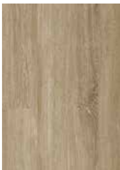
520 Savannah Oak