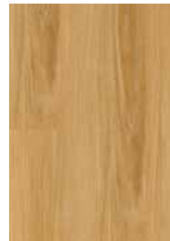
510 Tassie Oak